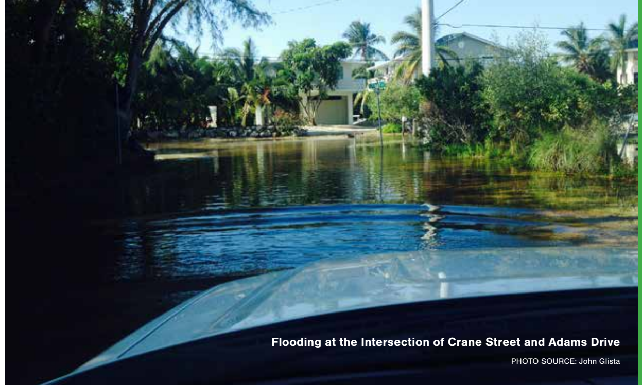
Flooding at the Intersection of Crane Street and Adams Drive

GreenKeys! has identified the likely impacts from sea level rise on various parts of County infrastruc-