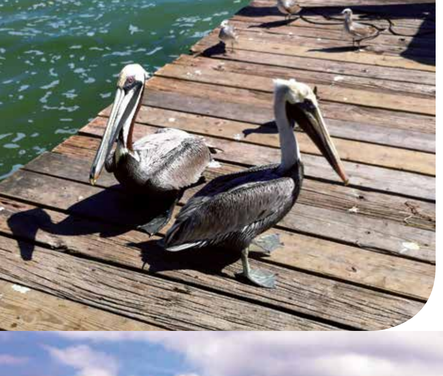
Monroe County, FL PHOTO SOURCE: